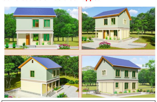
An architect's impression of the new teachers' rooms and reception/offices block

Having provided the funding for seven classrooms and a dining hall at St Jude's, Mto Wa Mbu, Tanzania, we are now concentrating on our next building for the school, a two-storey reception and staff room block.