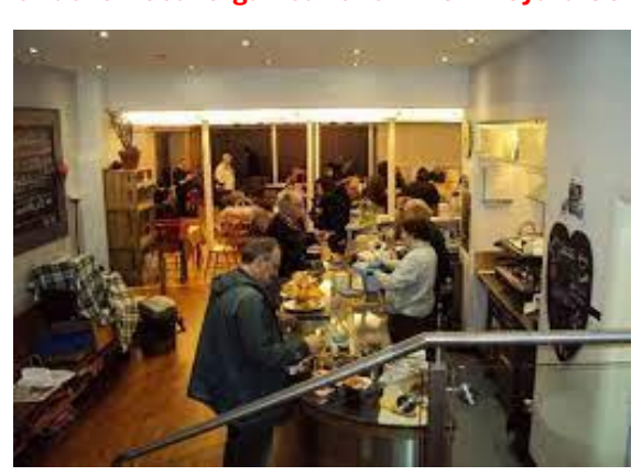
Volunteers pack food ready for distribution at the Vineyard Community Centre in Richmond

During the past year, SHOCC has continued to support local charities such as the Vineyard Community and Spear in Richmond upon Thames. In conjunction with the Assumption Sisters, we raised over £5000 for these organisations and for the Red Cross Turkey earthquake appeal.