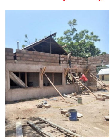
A photo received from Fr Peter on the 7<sup>th</sup> March showing the walls competed up to the ring-beam lintel.