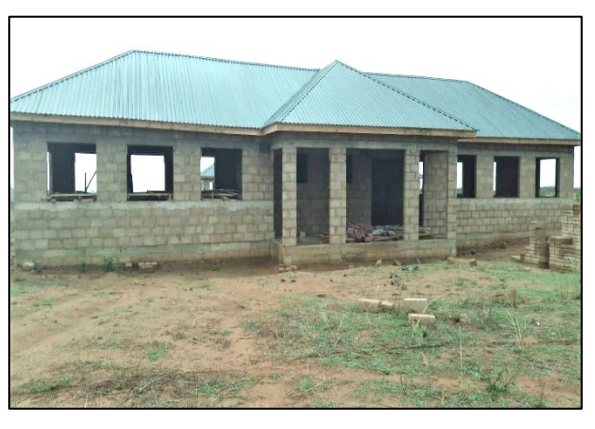
Within a week of the money arriving, work had begun on the new roof. Further donations will provide the windows and doors and furniture.

Your fantastic generosity and the proceeds of the St Cecilia's Day concert at the university enabled us to roof the school science block. The concert was such a great success that we are planning a follow-up in November. The photos show the building before and after the addition of the roof. Final work on fitting out the laboratories, plastering the walls and adding doors and windows can now be completed.