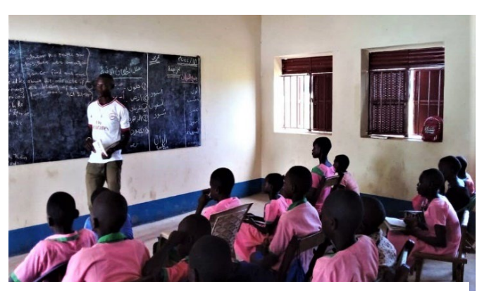
A class taking place in one of the new classrooms.

Several generous donations from a Simmarian alumnus have funded the construction of six classrooms at Christ the King School in South Sudan. Pupil numbers have increased steadily and now stand at 529 of whom 55% are girls.