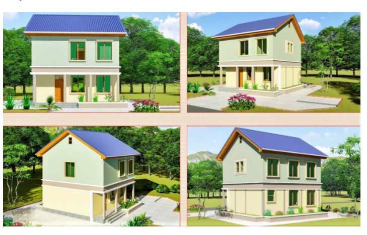
The architect's drawings of the proposed reception area and staff rooms at St Jude's. A two-storey building has been recommended to fill a narrow space between classrooms

SHOCC has been involved with St Jude's Infant and Primary Academy at since 2015 when scouts from Cleveland constructed the first two classrooms. Since then, we have funded another five classrooms and seen pupil numbers increase from around 70 to over 450. Results in the November 2022 Form 4 national examinations placed the school, third in the District.