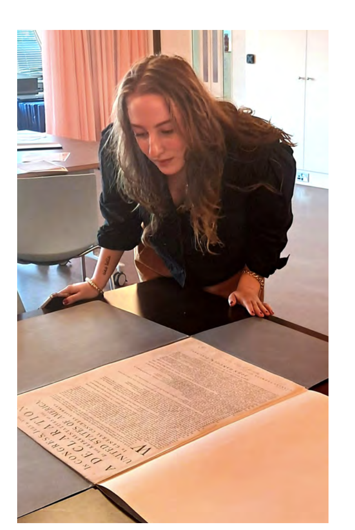
American History trainee looking at the American Declaration of Independence on the History PGCE visit to The National Archives

History in the UK is a combination of the substantive, disciplinary, chronological, thematic and skills, which includes both facts and sources. Revisiting the spiral curriculum is essential using chronology usually helps.